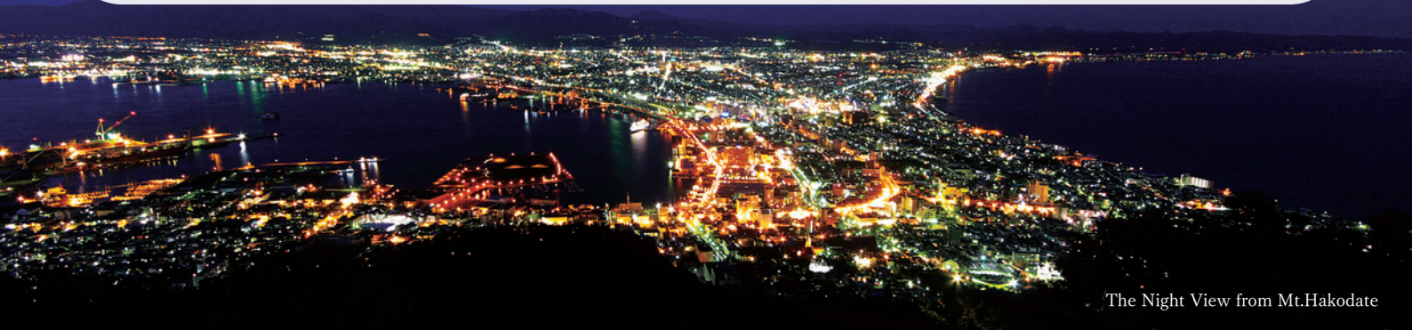
The Night View from Mt. Hakodate

For more information http://www.japanrailpass.net/en/